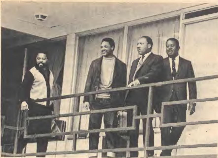
Martin Luther King standing on the balcony where, authorities say, he was shot by James Earl Ray (right).